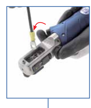
Remove the lug from the tool.